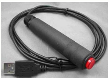
Patient Response Unit